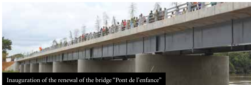
Inauguration of the renewal of the bridge "Pont de l'enfance"

For example, in the Adamawa Region, a bridge connecting Foumban, Tibati, and Ngaoundéré will be built over the Mayo-Nyawa River. In the North, there will be a bridge over the Mayo Sasseke River on the stretch between Poli and Fignole. In the Far North, another bridge will be built on the Douroum-Ouazzang-Massakal road.