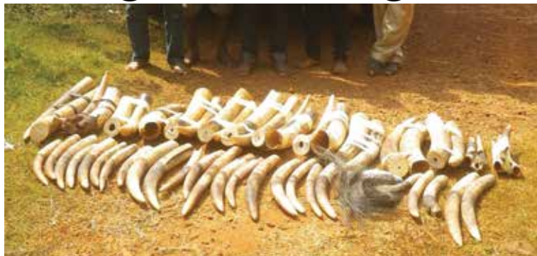
A demonstration of the severity of the threat wildlife faces in eastern Cameroon

On April 26, 2013, Cameroonian forces announced that 20 poachers armed with 45 firearms had been apprehended in the Lobeke, Boumba-Bek, and Nki parks, which are located in the Boumba, Ngoko, and Haut Nyong divisions. Two suspects who were caught with AK47s (Kalashnikovs) will be tried in the Bertoua military court, while the 18 others will stand trial in the Yokadouma civilian court. Eco-guards also seized two tusks, gorillas, chimpanzees, elephant meat, and other protected wildlife, according to the state-owned bilingual daily, the Cameroon Tribune .