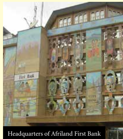
Headquarters of Afriland First Bank