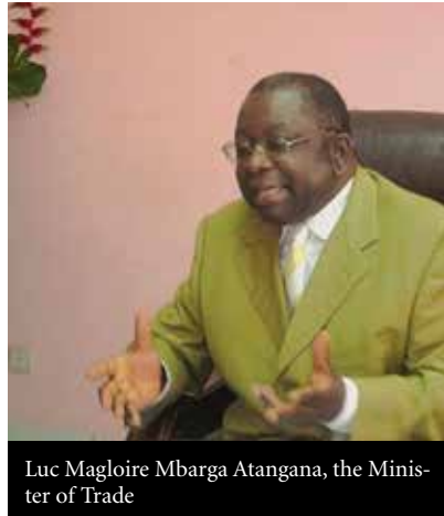
Luc Magloire Mbarga Atangana, the Minister of Trade

"It was recognised that our cocoa is in good shape. There is certainly room for improvement, but the solutions to our problems must be home-grown. We must not wait for our buyers to come to us be-