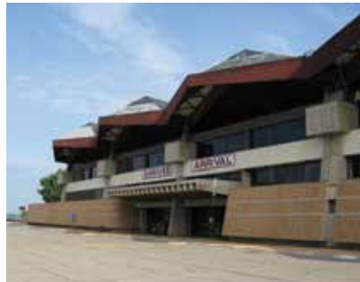
Departure entry and Arrival exit of Garoua Airport

In a press conference in Garoua on May 15, 2013, Robert Nkili, the Minister of Transport, announced that international flights will soon leave from Garoua. Currently, Cameroon has only two international airports: Douala and Yaoundé Nsimalen.