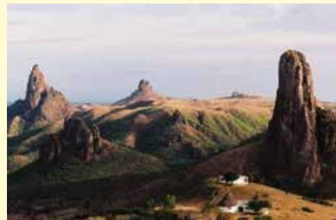
A view of Maroua

On May 3, 2013, Jean-Pierre Biyiti bi Essam, the Minister of Posts and Telecommunications, announced the construction of a hotel in Maroua, his department's headquarters in the Far North Region. The hotel was already planned for in the budget.