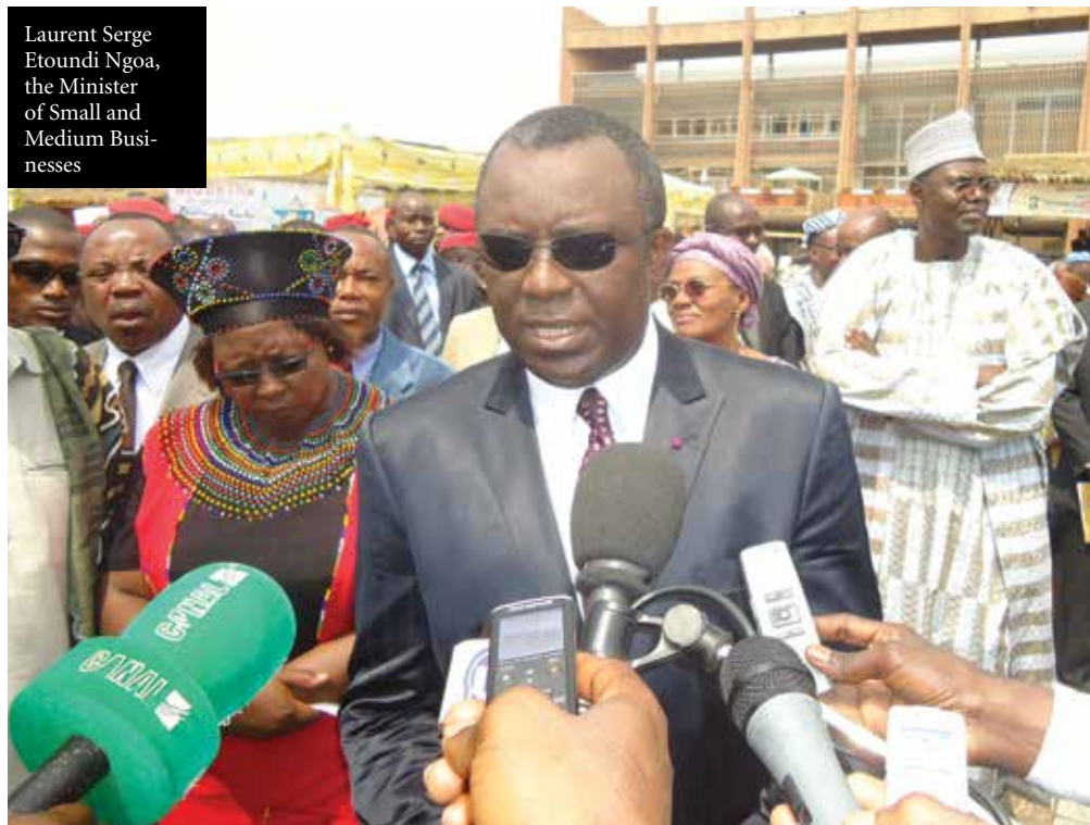
Laurent Serge Etoundi Ngoa, the Minister of Small and Medium Businesses

SMEs are facing several difficulties, the most important of which is access to funds. A prime ministerial decision stipulates that 30% of public contracts should be awarded to SMEs, but it is not being applied. The SME Bank, the Deposits Guarantee Fund, and the Agency for the Promotion of SMEs are some of the government's efforts to promote SMEs.