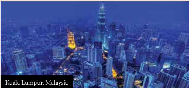
Kuala Lumpur, Malaysia

On April 26, 2013, a memorandum of understanding (MOU) was signed in Yaoundé between the Minister of Water and Energy, Basile Atangana Kouna, and the Chief Executive Officer of Asia Pacific Wing, Anam Bin Awang, reported The Cameroon Tribune , the state-owned bilingual daily.