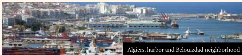
Algiers, harbor and Belouizdad neighborhood

Cameroon's Economic and Trade Days (ETDs) were held at the exhibition palace in Algiers from May 29 to June 3, 2013. The event was part of the International Trade Fair of Algiers (FIA), which hosted Cameroon as an honorary guest.