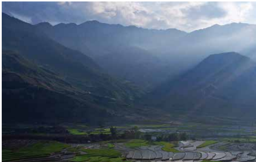
Burmese Rice Fields