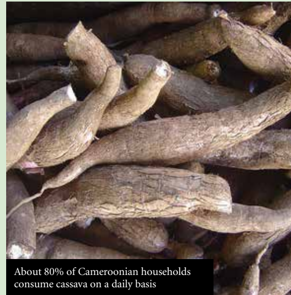
About 80% of Cameroonian households consume cassava on a daily basis