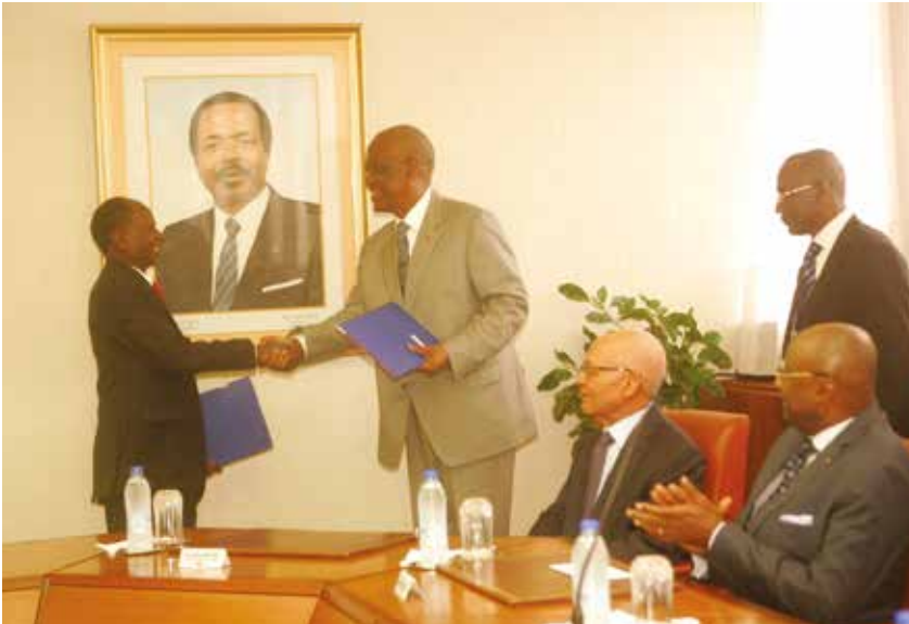
Cameroon's Minister of Mines, Industries and Technological Development, Emmanuel Bonde, and Niger's Minister of Energy and Petroleum, Foumakoye Gado

The Republic of Niger has reached an agreement with Cameroon to transport its crude oil across the country. Cameroon's Minister of Mines, Industries and Technological Development, Emmanuel Bonde, and Niger's Minister of Energy and Petroleum, Foumakoye Gado, signed a bilateral agreement to that effect at the head office of the National Hydrocarbons Corporation (SNH) on 30 October, 2013.