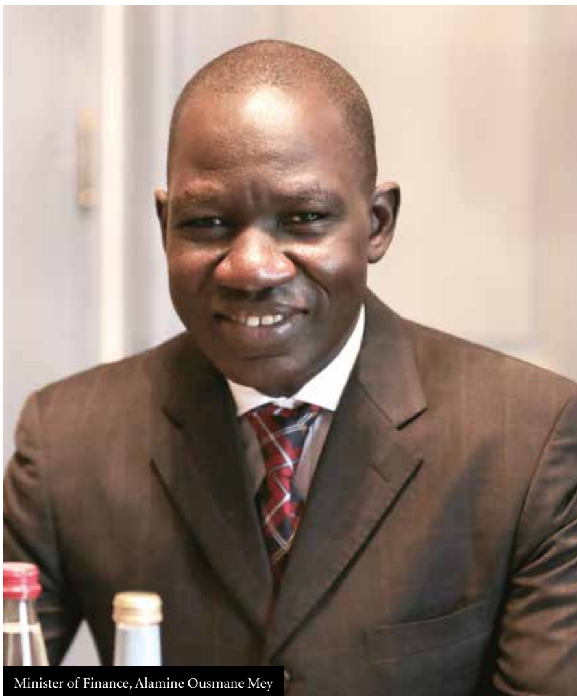
Minister of Finance, Alamine Ousmane Mey

in the implementation of EITI in Cameroon as well as concerned mining enterprises, civil society, and development partners, particularly the World Bank whose constant support has always been a valuable asset, the minister said “the different stakeholders to continue tirelessly with their efforts towards the respect of the principles, criteria, and