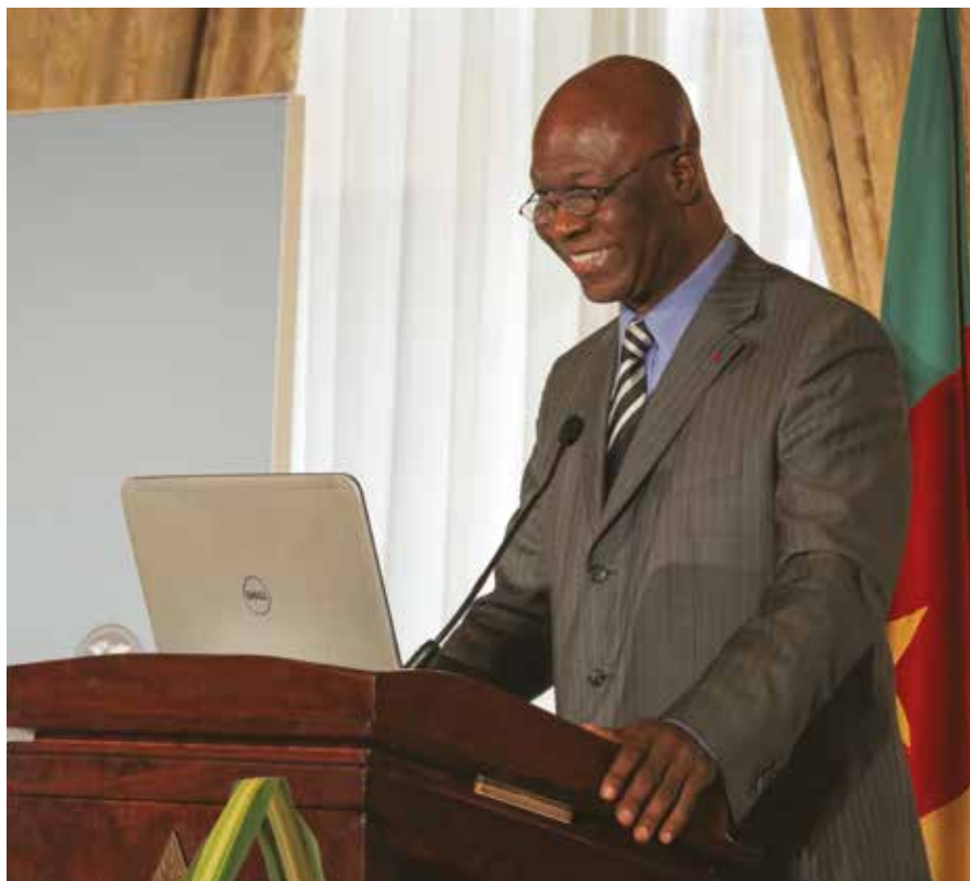
Minister of Agriculture, Essimi Menye

SEMRY promoting rice cultivation in Yagoua and Maga, the government wants to step up output. In the future, the company will extend its actions to Kousseri, a town in the Far North Region.