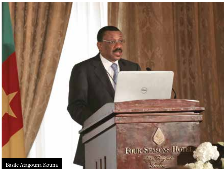
Basile Atangana Kouona

The government of Cameroon has signed an agreement with Electricité de France (EDF), the World Bank affiliated International Finance Cooperation, and Rio Tinto Alcan to provide 420 megawatts of electricity to the River Natchtgal area. The agreement was signed at the prime minister's office on 8 November between the Minister of Water Resources and Energy of Cameroon, Basile Atangana Kouona, and representatives of the institutions in the presence of Prime