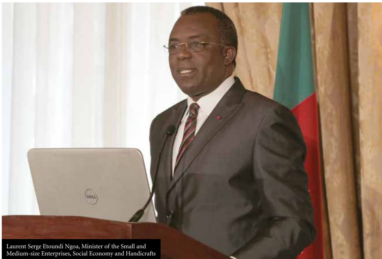
Laurent Serge Etoundi Ngoa, Minister of the Small and Medium-size Enterprises, Social Economy and Handicrafts

Cameroon's Minister of the Small and Medium-size Enterprises, Social Economy and Handicrafts, Laurent Serge Etoundi Ngoa, has said that the government has asked Japan, through the Japan International Cooperation Agency (JICA), to create development centres for Small and Medium-sized Enterprises (SMEs) in the country.