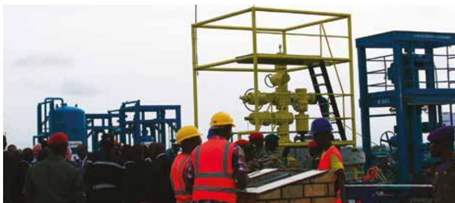
President Paul Biya inaugurated the gas plant on 15 November 2013