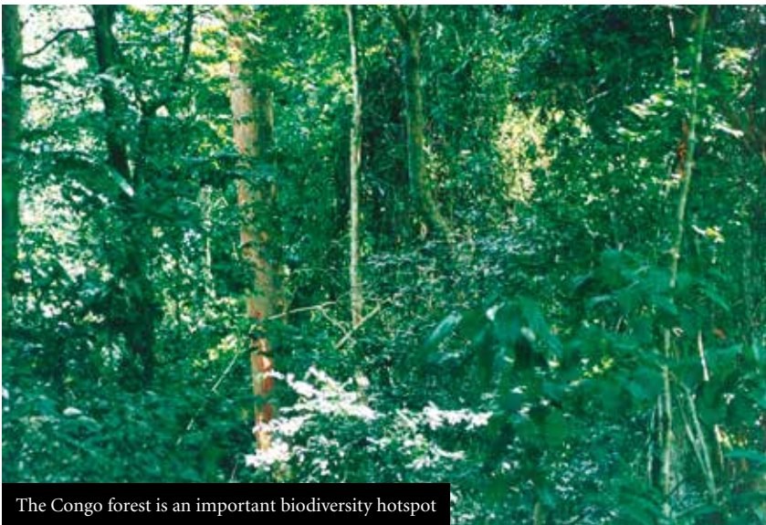
The Congo forest is an important biodiversity hotspot

Countries of the Central African Forest Commission (COMIFAC) have described the strides made half-way through an 18-month National Forestry Monitoring System (NFMS) project for the Congo Basin forest zone as “satisfactory”.