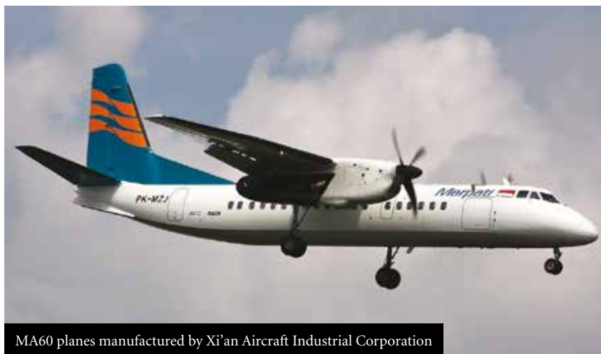
MA60 planes manufactured by Xi'an Aircraft Industrial Corporation

The People's Republic of China has loaned 196.8 billion CFA to the government of Cameroon for the supply of potable water in nine towns in the country, carrying out an emergency project in the country's telecommunications sector and acquiring two airplanes.