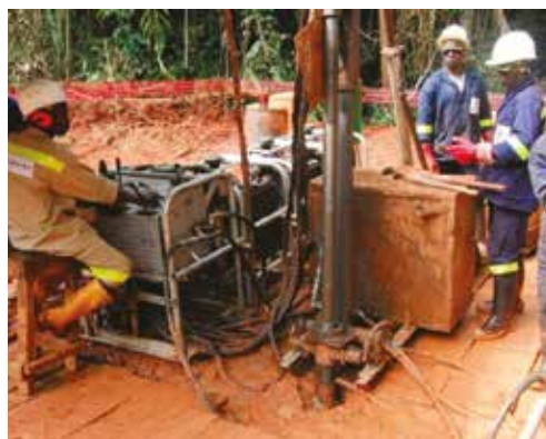
Rodeo Development Ltd heads plan to drill new wells in 2014 to increase production from deposits that are estimated to reach 11 billion cubic metres of natural gas.