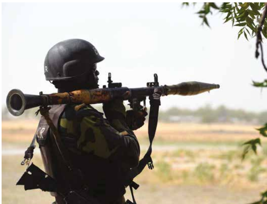
Indeed, in addition to the drop in international prices for crude oil, Cameroon has been involved for close to 3 years now in an expensive war against the Nigerian Islamist sect Boko Haram.

Indeed, in addition to the drop in international prices for crude oil, which has a significant impact on the public finances of the six CEMAC countries, Cameroon has been involved for close to 3 years now in an expensive war against the Nigerian Islamist sect Boko Haram, whose crimes in the Far North region have already cost the lives of over 1,000 people, officially. Coupled with the decline in non-oil revenues, mainly due to the entry into force of the Economic Partnership Agreements with the European Union in August 2016, and the slowdown in the national economy (projected growth rate of 3.7% in 2017, against 4.4% in