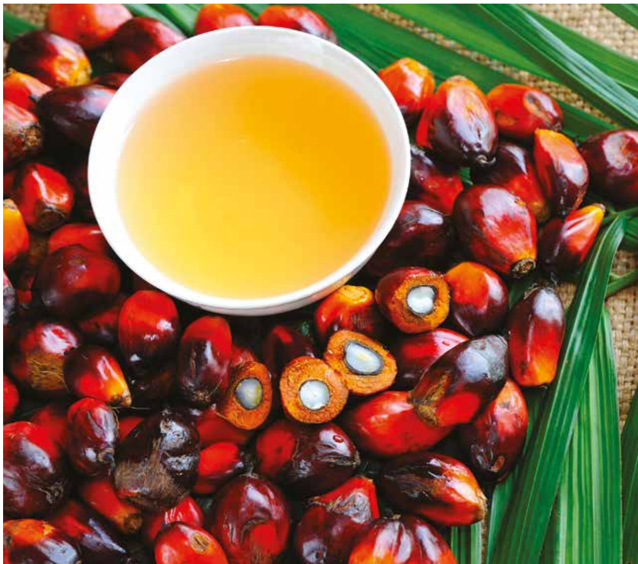
Commenting on the increase in the expenses invoked by Socapalm, and which would suggest financial difficulties in the company, Asroc reminds that the company declared “profits of FCfa 6 billion in 2016, with the distribution of FCfa 5 billion in dividends”.

declared, FCfa 5 billion in earnings after tax at end 2016, in decrease by over FCfa 1 billion compared to the FCfa 6.4 billion earned in 2015. Based on the financial statements of the company, the dividend to be distributed was FCfa 6.8 billion, Socapalm having decided to make a withdrawal from its “retained earnings”, to add to the amount to be shared between shareholders for 2016.