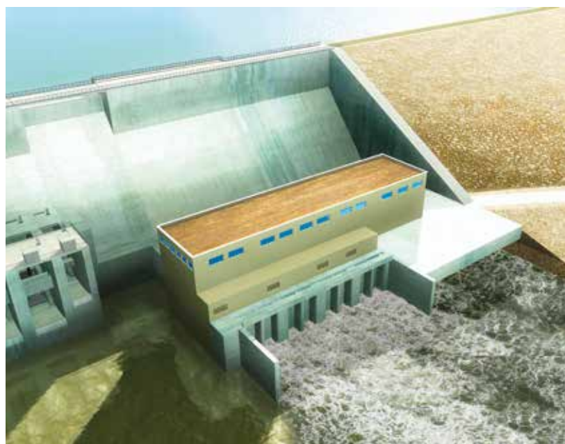
There is, firstly, “the Lom Pangar dam filling, which enabled us to reach a regular flow between 960 m 3 /s and 1,090 m 3 /s on the Sanaga”.

Then, we officially learned, the works carried out on the plants helped to achieve higher rates of availability for the machines (from 91% to 93% for hydropower and from 66% to 83% for