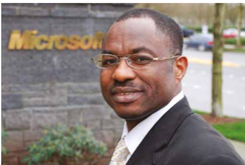
Over a period of 3 years, "Ocean Innovation Center" aims to train around 2,400 people in digital economy professions.

A four-storey building constructed on a plot of 1600 m 2 , 150 workstations spread out in twenty offices, four conference rooms, an auditorium, a telemedicine room and a lot more equipment; all linked to the rest of the world thanks to a very high speed optic fibre connection. This describes the technopole "Ocean Innovation Center", inaugurated on 11 July 2017 in the town of Kribi, seaside city in the region of South Cameroon, which houses two landing points of optic fibre submarine cables.